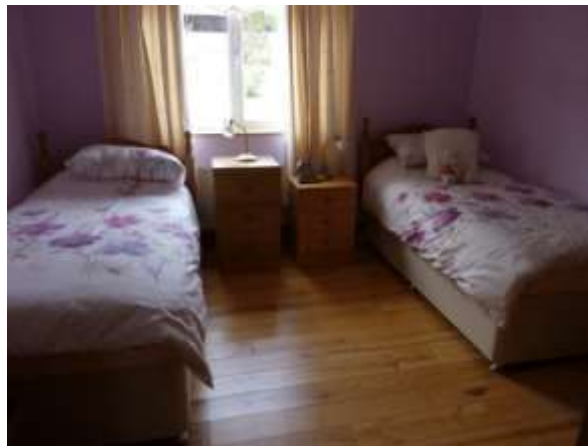
Bedroom (4): 16'4 x 13'11 Another superb room with 2 windows one a velux window. Ensuite: 11'7 x 6'10 Deep set vanity sink unit, electric shower, toilet, tiled floor, fully tiled walls, tiled floor.